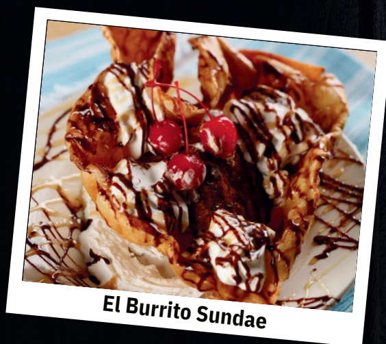
El Burrito Sundae