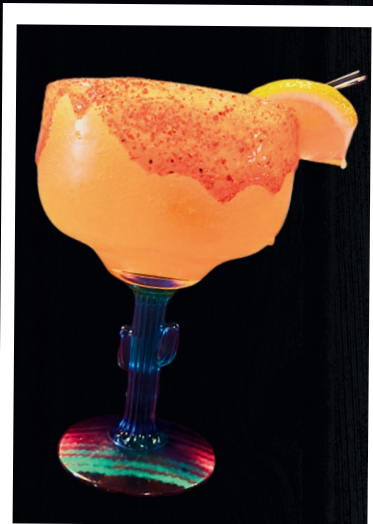
Mango Chili Lime Margarita

Margarita Mango Chili Lime Margarita Jalapeño Margarita Banana Blue Hawaii Mango Orange Cream Peach Piña Colada Raspberry Strawberry Daiquiri Watermelon