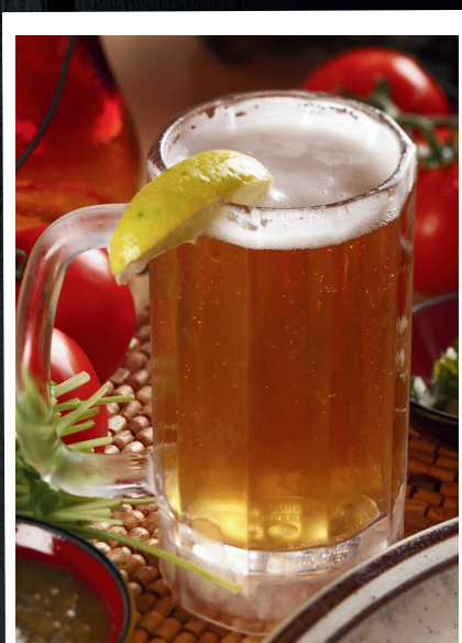
16oz draft beer